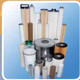
Liquid Filter Elements