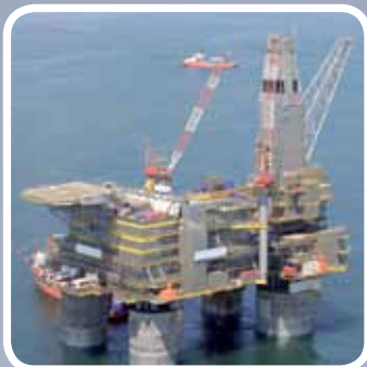
Offshore Exploration & Production