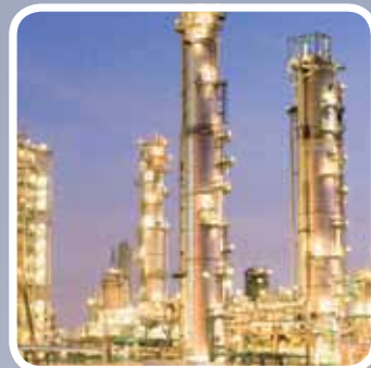
Refinery & Petrochemical