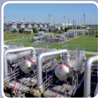
Gas Production, Transmission and Storage